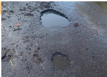
Let us know of any bad potholes like this one