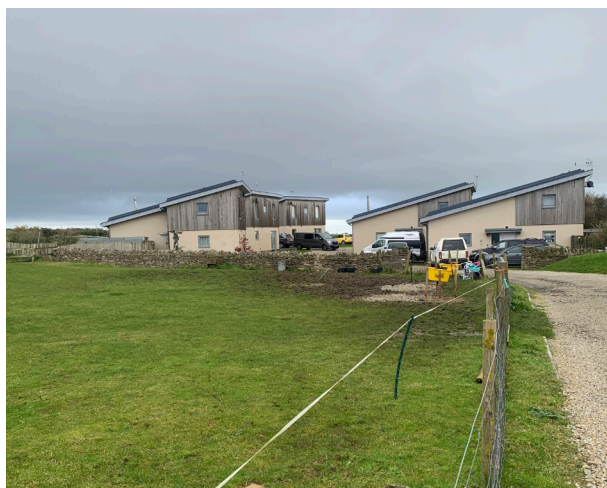
Community land trust development for locals in Worth Matravers

Nationally, Liberal Democrats at their recent conference agreed that local authorities should have greater power to control the conversion of houses to be used as holiday homes so that villages do not become like ghost villages outside the summer.